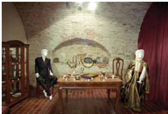
“Животни циклус - обичаји код Јевреја” (деталј)

- Jewish Customs - The Life Cycle -, staged in the Castle of Princess Ljubica, Belgrade, 1998, on the occasion of 50 years of the Jewish Historical Museum;