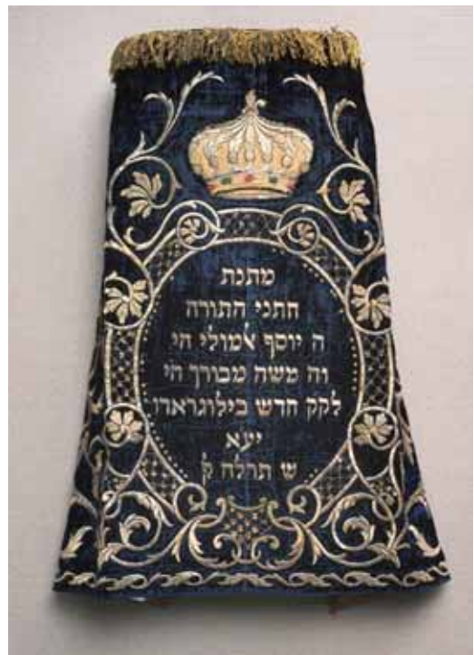
Везене тканине, детаљ

- Jews of Dorcol – The story of our neighbors who are no more , staged in Rex, Belgrade, 1997, and had a visiting exhibition in Erfurt, Germany, 1998.;