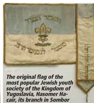
The original flag of the most popular Jewish youth society of the Kingdom of Yugoslavia, Hasomer Hachair, its branch in Sombor

➤ Youth workers' and students' societies, their gatherings and events, picnic and working camp activities (hahshare – training in farming and crafts as preparation for Israel and staying in moshav – youth camps).