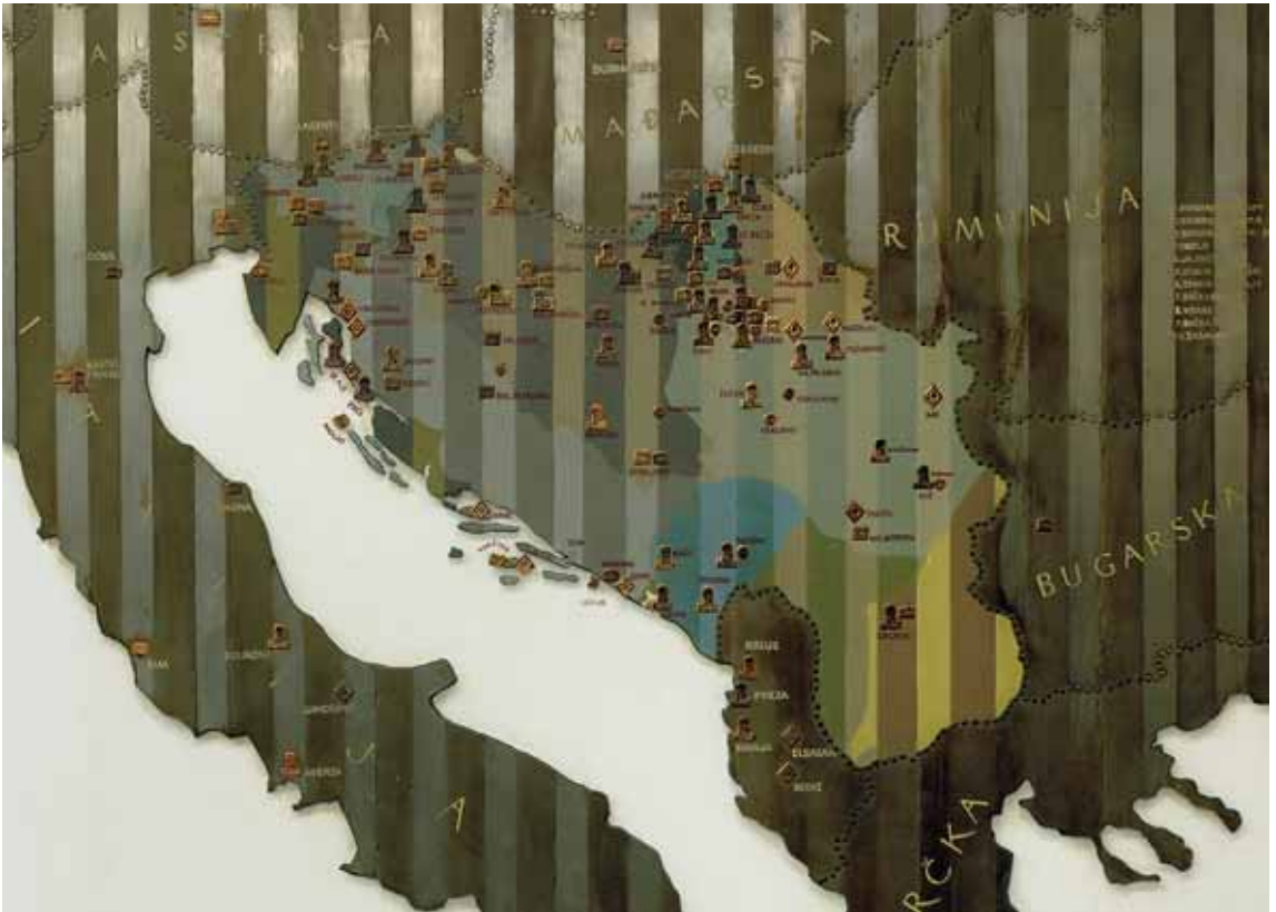
▲ The map of Yugoslavia with occupation zones and marks of death camps. Collection camps, concentration camps, prisons and mass murder sites.

Serbia was occupied by the Germans, who put an end to any protest by means of fierce crimes against the civilian population. Arrests, executions, hanging followed. Serbia was the only occupied country in Europe in which the Germans put in practice the rule "100 for one" – for one killed German one hundred civilians were executed. However, the ones who were to face total extermination were the Jews. This specific, total genocide against the Jews, the Holocaust, was carried out so systematically, so pedantically, that the German military commanders, after only several months of occupation, sent a message to Berlin that Belgrade was "free of Jews". And truly, about 10,000 Belgrade Jews have perished, and about 85% of all the Jews living in Serbia had perished. There were German camps in Belgrade itself, as well as in other towns in Serbia, there were mass executions, mass plundering of property ... the Holocaust.