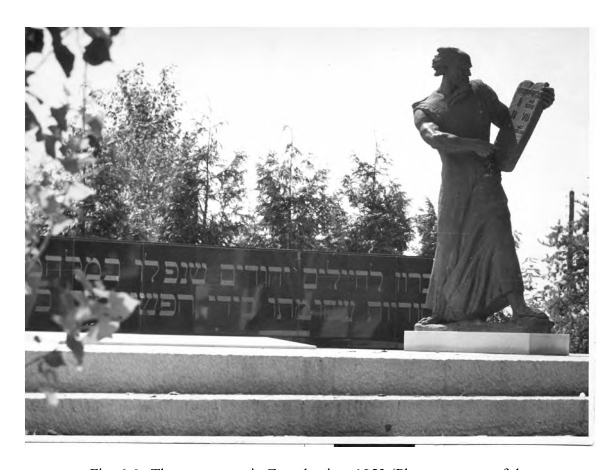
Fig. 6.6. The monument in Zagreb, circa 1952 (Photo courtesy of the Jewish Historical Museum, Belgrade).