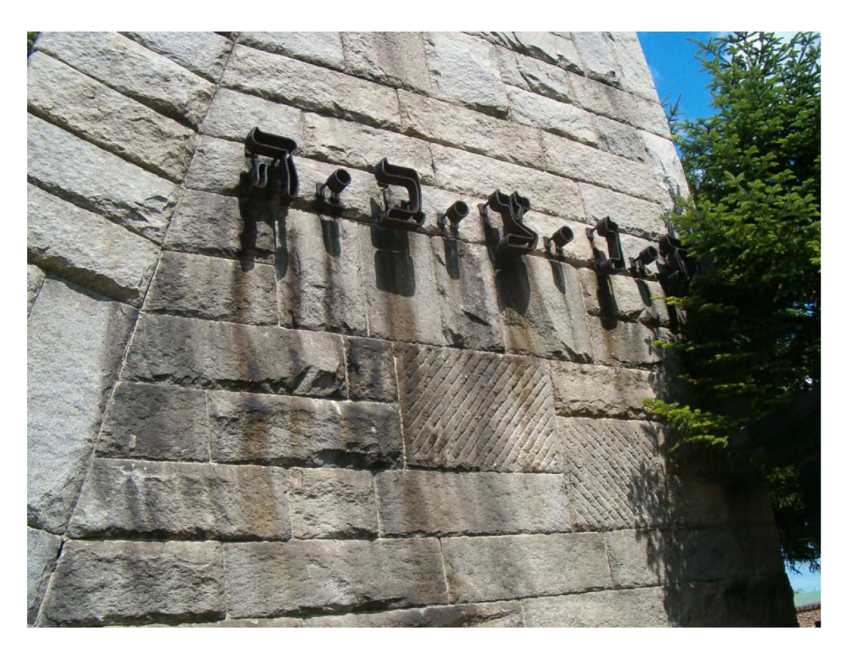
Fig. 6.5. The monument in Belgrade, detail. The Hebrew acronym is usually translated as "may his soul be bound in the bonds of eternal life" (Photo: Emil Kerenji, 2006).