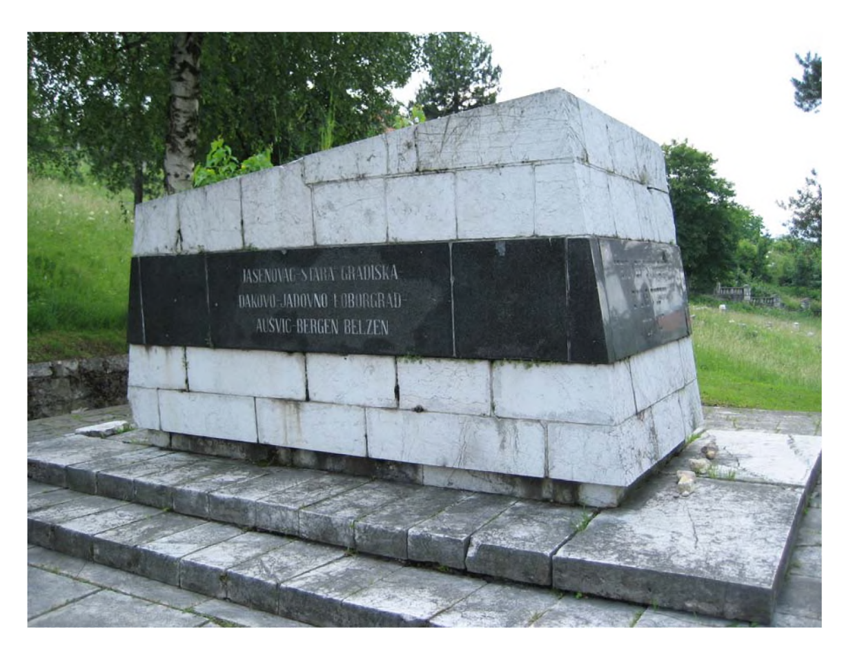
Fig. 6.9. The monument in Sarajevo. The inscription lists camps and execution sites in NDH (Jasenovac, Stara Gradiška, Đakovo, Jadovno, Loborgrad) and in Nazi Germany and occupied territories (Auschwitz, Bergen Belsen).