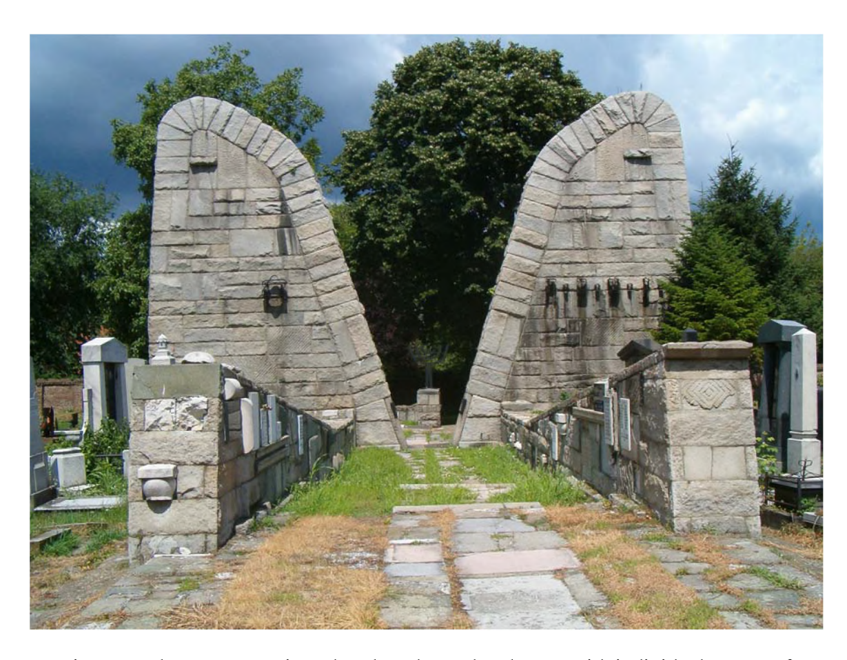
Fig. 6.2. The monument in Belgrade today. The plaques with individual names of victims were added subsequently, starting in the 1980s.