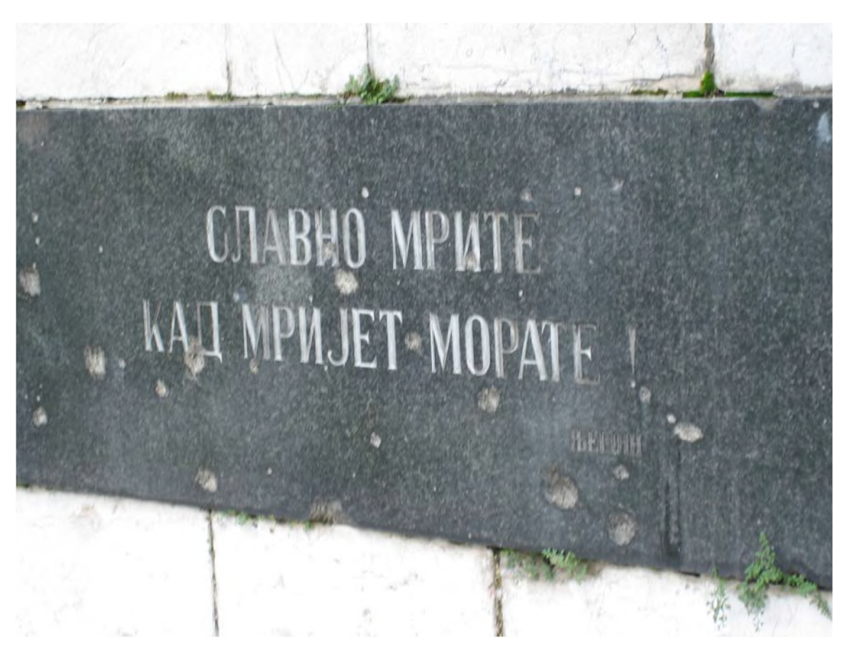
Fig. 6.12. The monument in Sarajevo today, damaged by shrapnel. The inscription is a quotation from Gorski vijenac by Petar Petrović Njegoš, and reads: "Die in glory if you have to die!".