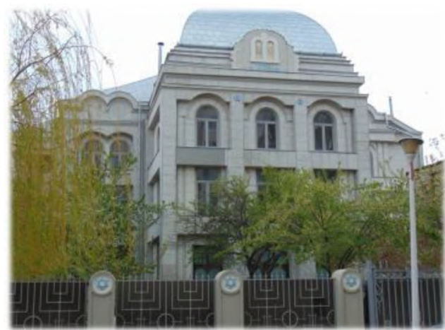
The Synagogue in Galati

After having rediscovered this hidden and partly forgotten heritage of the Danube region, the project partners have elaborated the local portfolios of potential tourism products and services based on the Jewish cultural heritage, and the joint transnational tourism route based on the Jewish cultural heritage of mid-sized Danube region cities. Their objective is to create the Joint Visibility Strategy and Community-sourced Jewish Cultural Heritage Valorisation Handbook, web repository of this heritage of all the partner cities, mobile application presenting the heritage of the individual cities and a series of cultural events based on the rich cultural heritage of our citizens of Jewish origin.