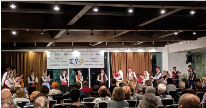
Mahar, Nastup crnogorske folklorne grupe

Hotel „Avala“ oduševio je i ove godine – osoblje je ljubazno, hotel uredan, obroci odlični. Hrana je bila košer, a kuhari su pokazali koliko raznovrsno i ukusno se ona može pripremiti (što je na nekim prethodnim seminarima bio problem). Kako je hotel uz samu staru jezgru Budve, tako su mnogi iskoristili slobodno vrijeme za šetnju i neizbježni šoping. Program nije bio pretrpan, pa je bilo vremena za sve. Također su i plaže odmah uz hotel pa su mnogi prva dva dana konferencije uživali u kupanju u moru koje je za ovo doba godine bilo neuobičajeno toplo, nekih 22° C, jednako kao i temperatura zraka. A ako je nekome to ipak bilo hladno, tu je bio bazen i spa centar.