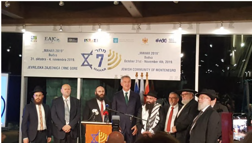
Mahar in Budva: Opening ceremony

The subjects of the lectures given at the Conference covered a variety of themes: the challenges imposed on Jews in modern world and how to handle them, the focus being on Jews living in the States; the challenges Israel