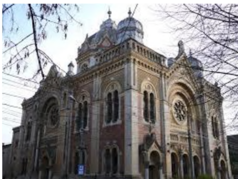
Fabric sinagoga u Temišvaru

Temišvar (rumunjski Timișoara) je grad u zapadnoj Rumunjskoj poznat po svojoj secesijskoj arhitekturi. Od židovskih građevina značajna je Cetate sinagoga sagrađena za potrebe neologijskog judaizma. Izgrađena je prema projektu arhitekta Karla Schumanna od 1863. do 1864., a otvorena 1865. Sinagoga Fabric_u Ulici I. L. Caragiale 2, izgrađena je po projektu mađarskog arhitekta Lipóta Baumhorna, koji je između ostalog osmislio neološke sinagoge Brašovu i Segedinu. Židovsko groblje u Temišvaru sadrži važan dio povijesti grada i moglo bi se pretvoriti u muzej na otvorenom. Getta Neumann, kći Ernsta Neumanna, bivšeg rabina Temišvara, iako živi u Švicarskoj, brine se dugi niz godina o sudbini židovskog groblja. Na groblju se nalazi preko 11.500 grobova.