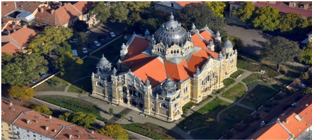
Sinagoga u Segedinu

je danas židovska opština. Mjesta, stanovi i kuće odakle su u vrijeme Holokausta odvođeni Židovi obilježeni su „kamenima spoticanja“ - „Stolpersteine“, malenim natpisima na pločniku zgrada gdje su stanovale žrtve. - način obilježavanja spomena na sudbine stradalih osoba u nacističkim progonima, kako poginulih tako i preživjelih žrtava u njemačkim koncentracionim logorima,