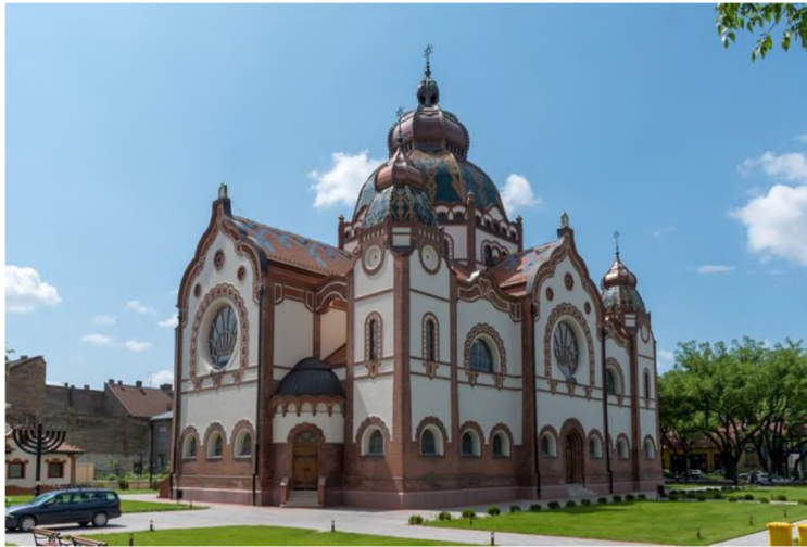
The Sinagogue in Subotica

The Jewish cemetery with the children's cemetery is located next to the former Halas gate. It was first mentioned in 1777. Some 1,300 cemetery monuments represent the entire cultural history of the Subotica Jewish community due to the fact that the Jews did not bury their dead on top of each other. The Jewish cemetery - in Hebrew 'bet ha-quorum' (house of graves) or 'bet ha-haim' (house of living) and 'bet olam' (eternal hideaway) is the eternal home of all who once lived. The interior of the graveyard consists of three time sectors, and one sector is a memorial part: The first part is the oldest, intended for burial, where the dead were buried until the First World War, In the second part the burials were conducted between two world wars, and the 3rd part was used for burial after the Second World War. The fourth part is the Memorial part of the cemetery with a memorial for the