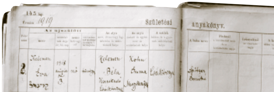
From the Jewish parish register - Jewish Community Čakovec