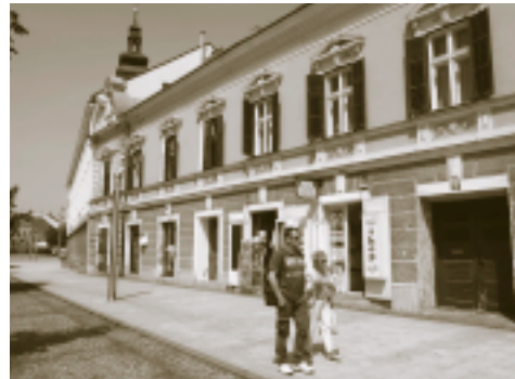
Strolling through Čakovec in 2014