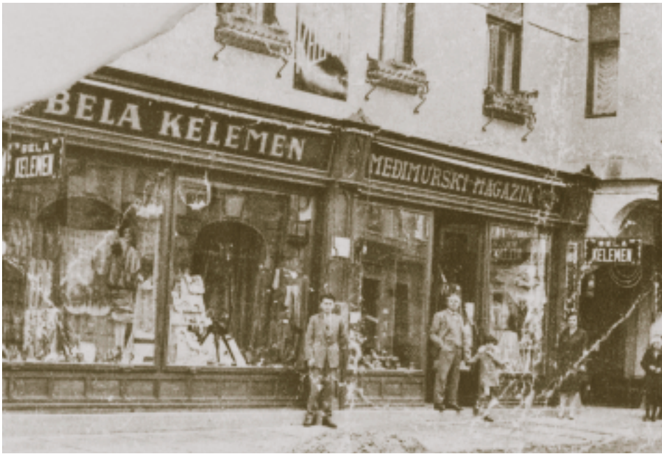
Kelemen family house in the center of Čakovec during the first years of 20th century. There was a store on the ground floor. Today it is 5 Kralja Tomislava Street.