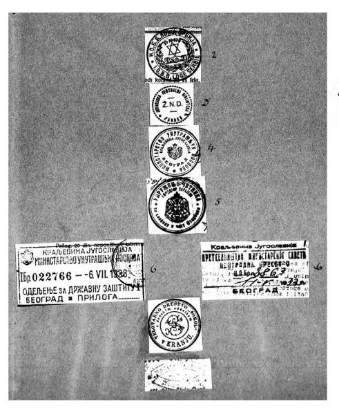
Library markings from books looted in Serbia collected by the U.S. Army at the Offenbach Archival Depot. M 1942, Offenbach Pictures: Library Markings from Looted Books<sup>4</sup>