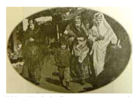
Tables II/4: Sephardic women on a street in Sarajevo, photograph published in Dr. Moric Levi, Die Sephardim in Bosnien , Sarajevo, 1911