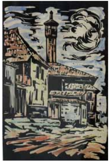
Tables I/2: Daniel Kabiljo, A Street in Sarajevo , colored linocut, 1937(?), private collection, Sarajevo