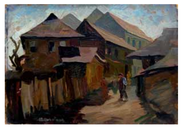
Tables IV/1: Daniel Kabiljo, From the Outskirts of Sarajevo, oil on canvas, 1920s-1930s, courtesy of the Art gallery of Bosnia and Herzegovina, Sarajevo