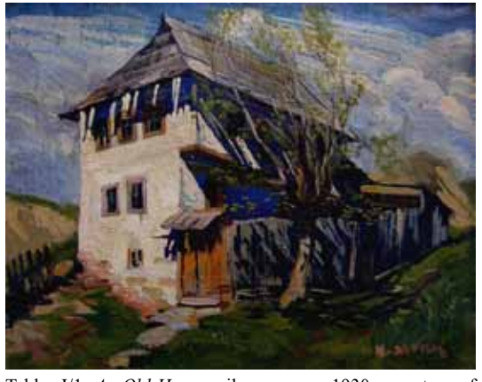
Tables I/1: An Old House, oil on canvas, 1930s, courtesy of the Art gallery of Bosnia and Herzegovina, Sarajevo