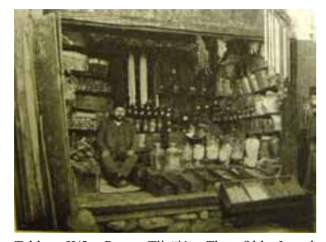
Tables II/5: Petar Tiješić, The Old Jewish Pharmacy , oil on canvas, 1953