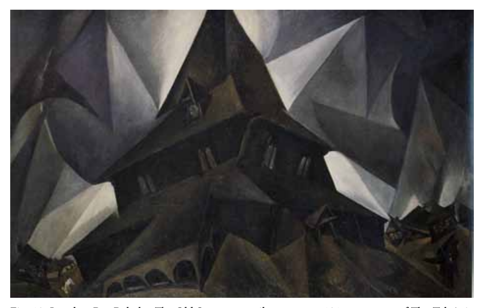
Fig. 10: Issachar Ber Rybak, The Old Synagogue , oil on canvas, 1917, courtesy of The Tel-Aviv Museum of Art