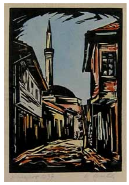
Tables IV/2: Daniel Kabiljo, A Street in Sarajevo , colored linocut, 1920s-1930s, courtesy of the Art gallery of Bosnia and Herzegovina, Sarajevo