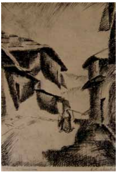
Tables IV/3: Daniel Kabiljo, A Street in Sarajevo , India ink on paper, 1920s-1930s, courtesy of the Art gallery of Bosnia and Herzegovina, Sarajevo