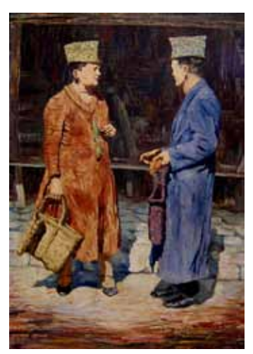
Table III/5: Daniel Kabiljo, The Conversation , oil on canvas, 1930s, courtesy of the City Museum of Sarajevo