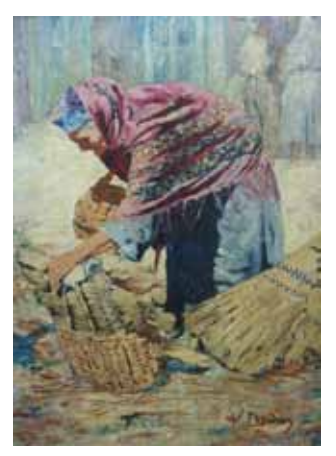
Table III/4: Daniel Kabiljo, The Old Sephardic Women on The Market, oil on canvas, 1935, courtesy of the City Museum of Sarajevo