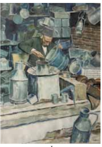
Tables III/2: Petar Šain, The Tinsmith , oil on canvas, 1920s, private collection, Sarajevo