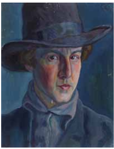
Table I/5: Roman Petrović, Self-portrait , oil on canvas, 1918-19