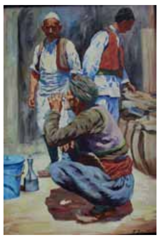
Table II/1: Daniel Kabiljo, Motifs from Sarajevo's Old Turkish Market (Baščaršija), oil on canvas, 1920s-1930s, praivate collection, Sarajevo