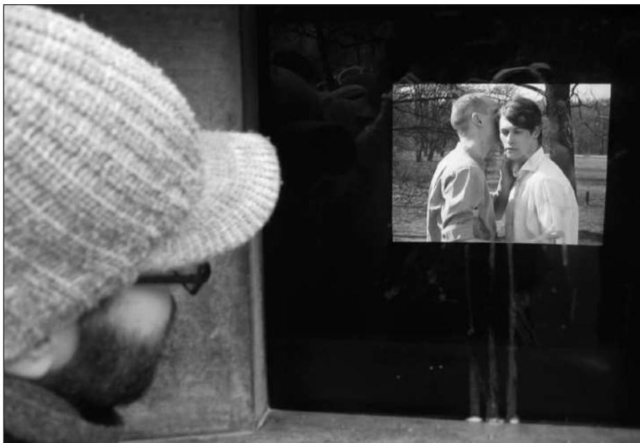
Memorial to the Homosexuals Persecuted under the National Socialist Regime

A memorial to homosexuals persecuted under the National Socialist regime was dedicated in May 2008, initiated and fought for by activists of the gay movement.